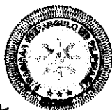
BENIGNO S. AQUINO III