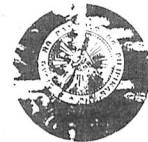
EDUARDO R. ERMITA Executive Secretary