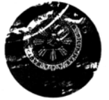
ALBERTO G. ROMULO Executive Secretary